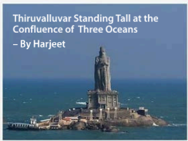
Thiruvalluvar Standing Tall at the Confluence of Three Oceans - By Harjeet