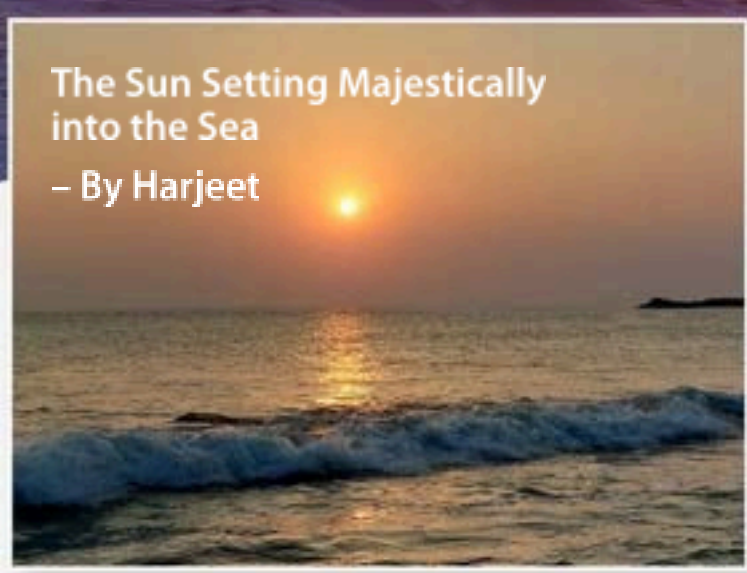
The Sun Setting Majestically into the Sea - By Harjeet