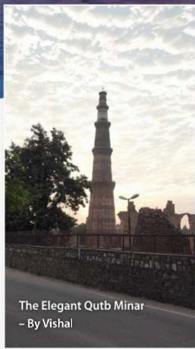
The Elegant Qutb Minar - By Vishal