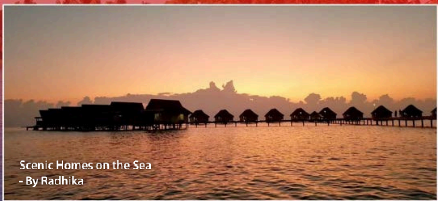
Scenic Homes on the Sea - By Radhika